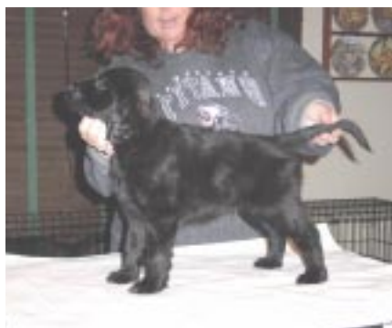
Bear Country Little Guy "Cub"

time. It is a very gratifying experience, but because I put so much time and effort into raising a litter within my own standards, we don't breed that often. We also wait until the dog has reached full maturity so we know if it is truly what we want to reproduce (i.e. temperament, structure, trainability).