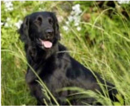
Jamie, Ch Hardscrabble Feather Fetch'r CD MH WCX

conformation people) to get out and see what their fluff balls