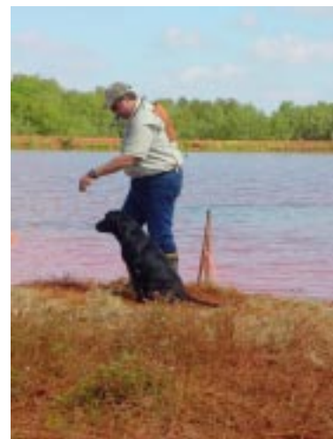
Clint and Mac

The Bear County kennel name came as a result of having our first litter of golden puppies. As you all know, there is nothing cuter and furrer than a golden puppy at six or eight weeks. We have bred several golden litters in the past and have bred four litters of FCR; two out of Windy and two out of Fever. Both of these bitches were bred at 8 years old as we were just having too much fun testing and trialing, and finally realized we better do something or we would run out of