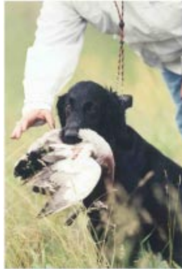
Ch Twin Oaks Spring Fever MH WCX***

to some nice fields and ponds by the house that we use for training as well. I am President of the Middle TN Amateur Retriever Club here in Nashville and we hold two AKC Hunt Test and two AKC Field Trials each year. We also travel to several other loca-